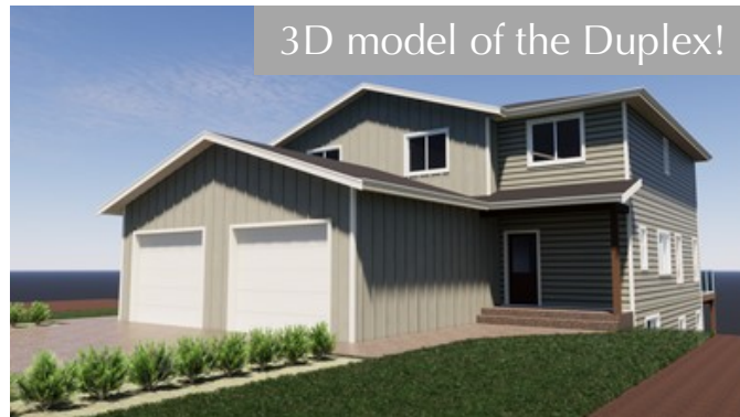
3D model of the Duplex!